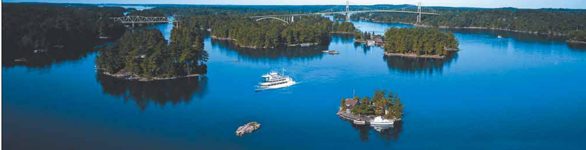
The Thousand Islands Waterway is a beautiful setting for a cruise