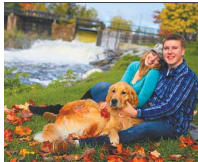
A crisp fall day along the Rideau Canal